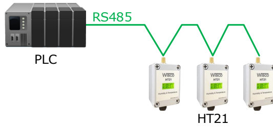
Connection via PLC